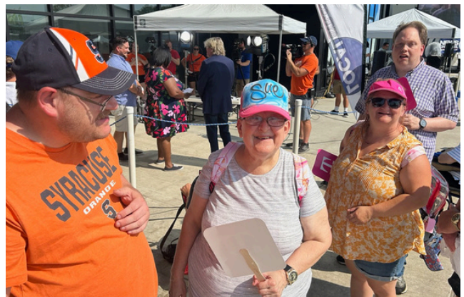
LIFE Day Hab at The Great New York State Fair