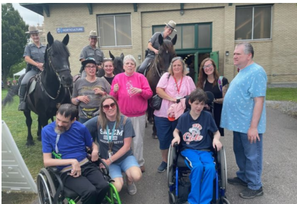
Group Day Hab at The Great New York State Fair