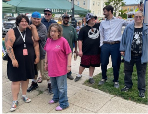
Respite visited the Greater Oswego-Fulton Chamber of Commerce Farmer's Market.